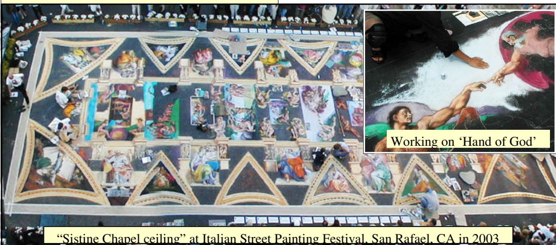
"Sistine Chapel ceiling" at Italian Street Painting Festival, San Rafael, CA in 2003